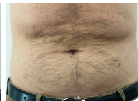
60 days After/1 session