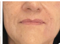
90 days after/1 session