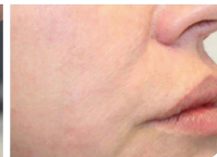
60 days after/1 session